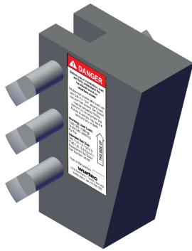
Part No. 11-180