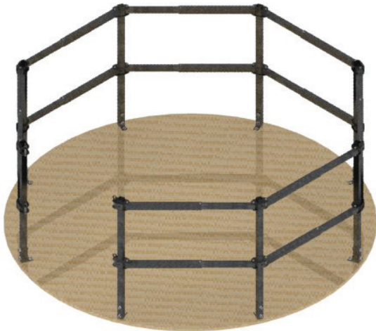
Part No. 18-400-R

This handrail kit shares all the same great features of the Wurtec 18-400 series top of car handrail, but it is octagonal making it an easy fit for round car tops ranging from 74" to 120" in diameter.