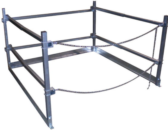
Part No. 18-400